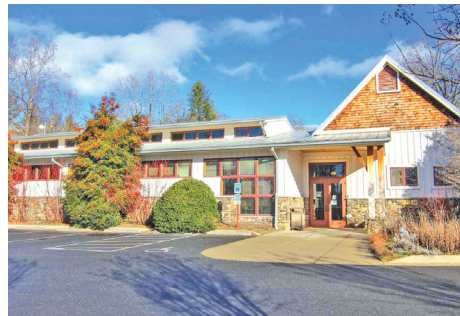
Fairview Library is an approved early voting site.

For our readers who live in Gerton and Fletcher, visit hendersoncountync.gov/elections for more information.